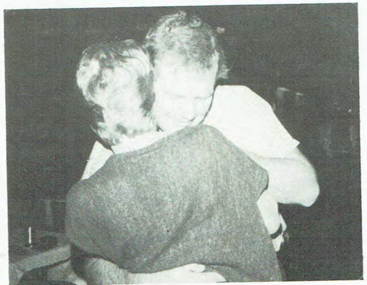
RUCKING PRACTICE ??