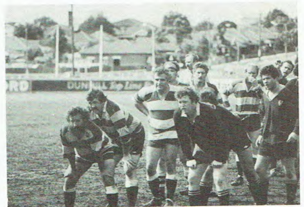
Now is that a T.T.? . . . . An Apple? or . . . . A double T.T.??