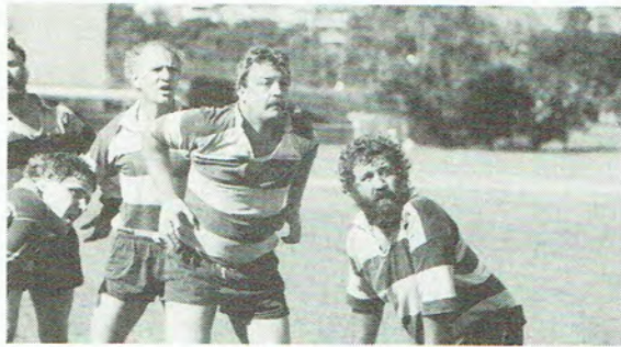
"Keen - Young - Intelligent - Fit - "