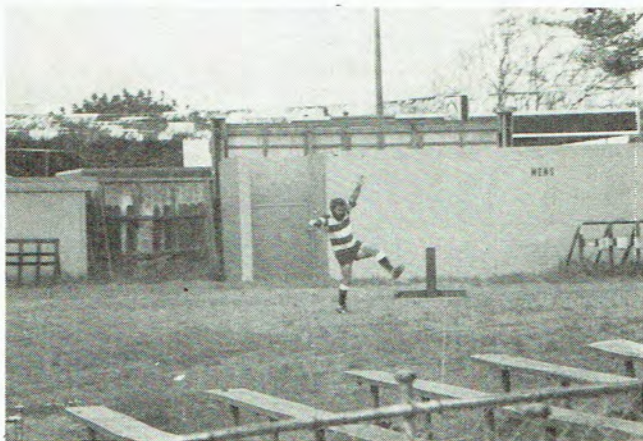
Spot the Ball!

I find The aim to you $ 15.00 28 1.00 en