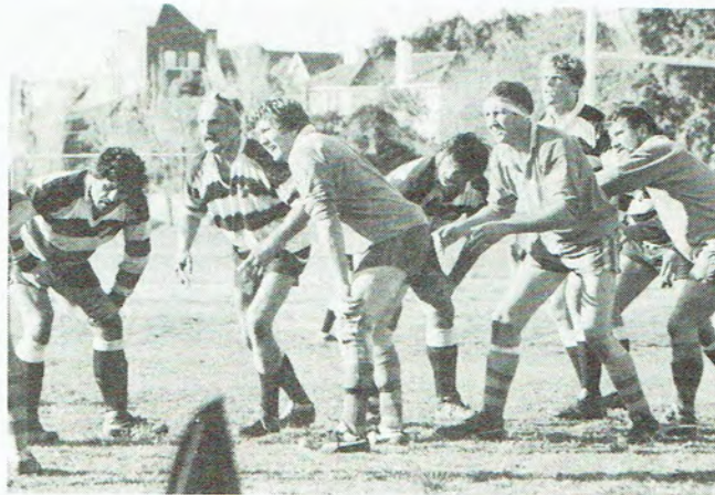
'Not now, mate, I'm stuffed.'