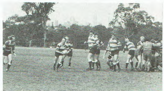
Another tight ruck win . . .