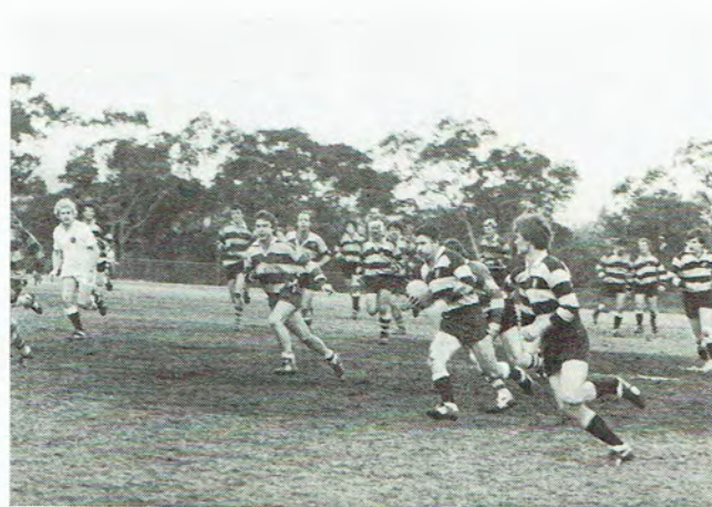
Still got it, Toolie??