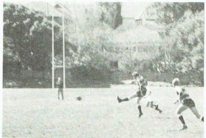
Low Trajectory Kick . . .