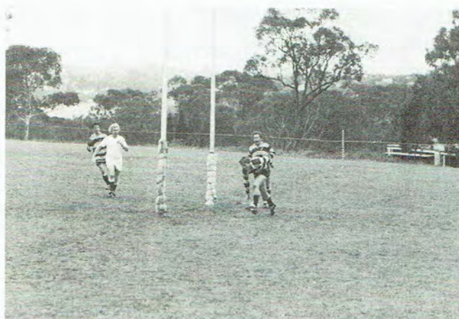
Oops! I dropped it . . .