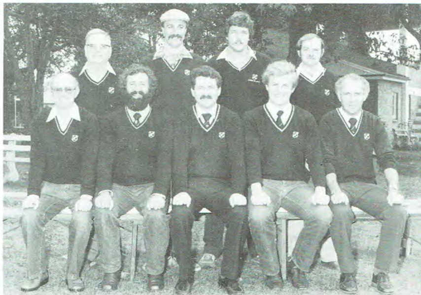
COMMITTEE MEMBERS 1983